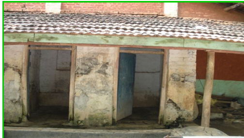
Boys Toilet @ Kevadi