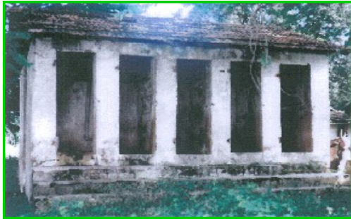
Old Boys Toilets