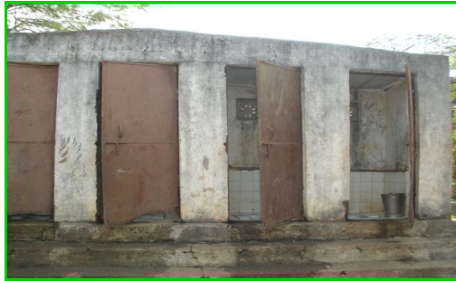
Girls shower room