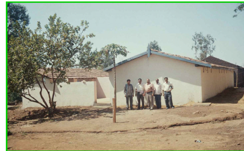
Entrance to Girls Toilets