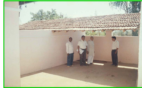
New Laundry Area