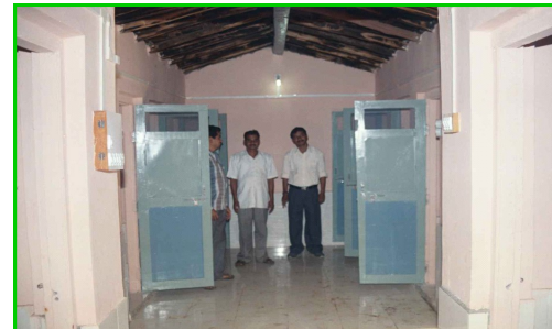
New Shower Cubicles for Boys