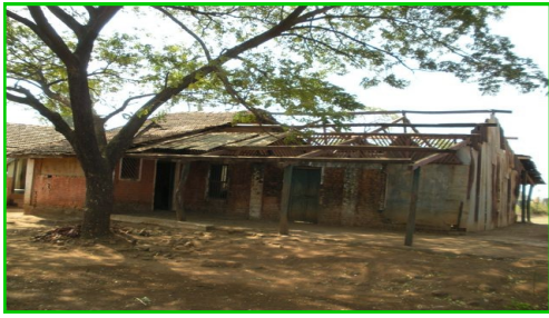
Boy's Old Sleeping area, Ambavadi