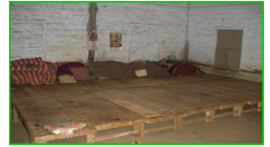
Girls Sleeping Area