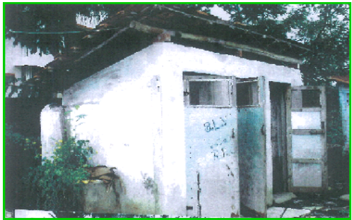
Old Girls Toilet