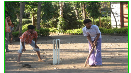
Boys playing Cricket