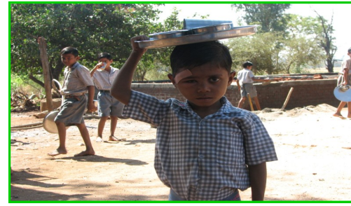
Five year old Child