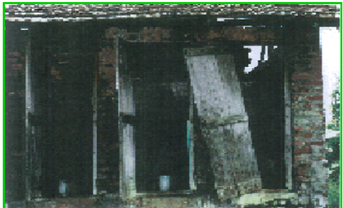
Old Girls Shower Rooms