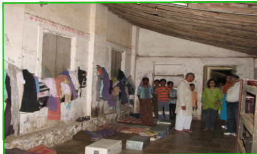
Current Sleeping Area