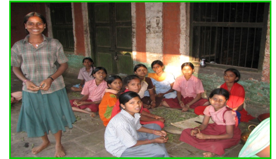
Girls helping to clean Vegetables