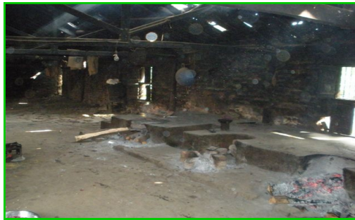
Kitchen/Store Room at Kevadi